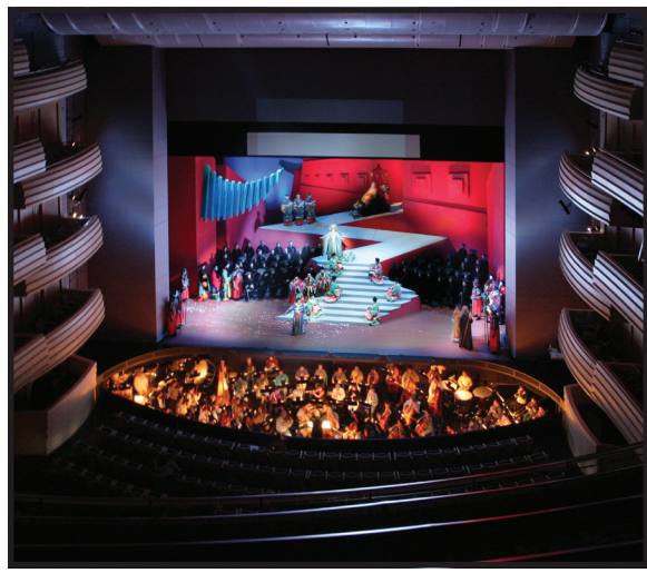
Overture Center for the Arts, Madison, WI 2005

www.kirkegaard.com Telephone: +1 312 441 1980 Telephone: +1 303 442 1705 Telephone: +1 314 896 2511 Telephone: +1 832 975 8850