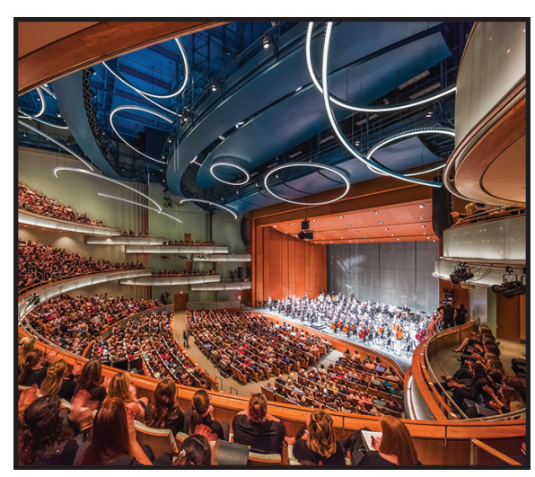
University of Iowa - New Hancher Auditorium, Davenport, IA 2016